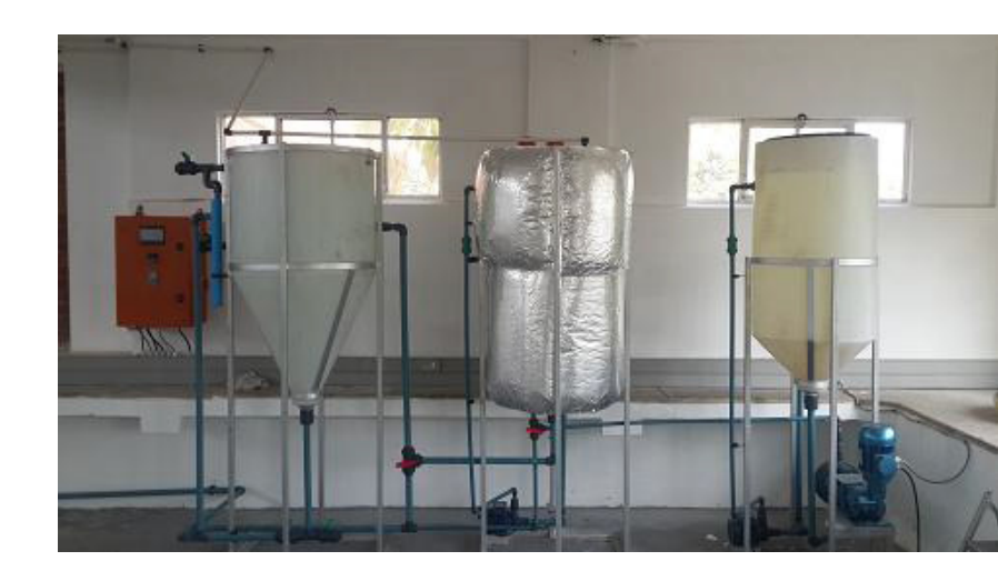
Modified CSIR design (ETM Pilot Plant)