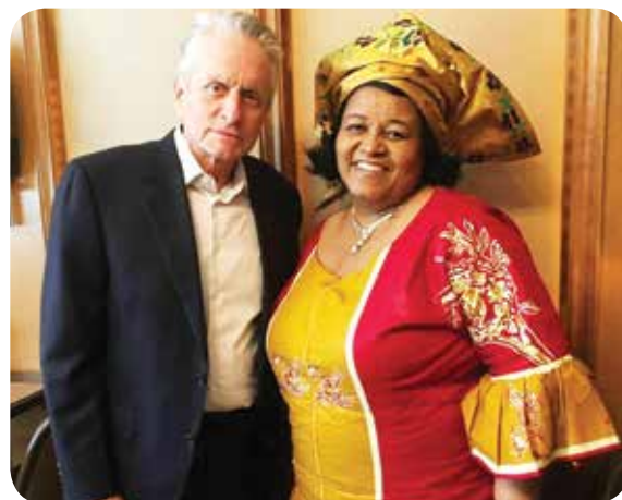
Above: Minister Molewa signs the Paris Agreement on climate change at the United Nations headquarters in New York. On the sidelines of this high signature ceremony, Minister Molewa takes a photo with accomplished actor and UN Messenger of Peace Mr Michael Douglas.

History was made on 22 April 2016, when South Africa became one of 172 countries to sign the Paris Agreement on climate change, as this was the highest number of parties to sign such an agreement in one day. Minister of Environmental Affairs, Edna Molewa, signed the Paris Agreement on behalf of South Africa at the UN headquarters in New York.