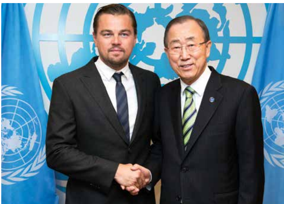
Above: United Nations Secretary-General Ban Ki-moon has designated Academy Award-nominated actor and committed environmental activist, Leonardo DiCaprio, as a UN Messenger of Peace.

The Paris Agreement is widely regarded as a ground-breaking point in the development of the