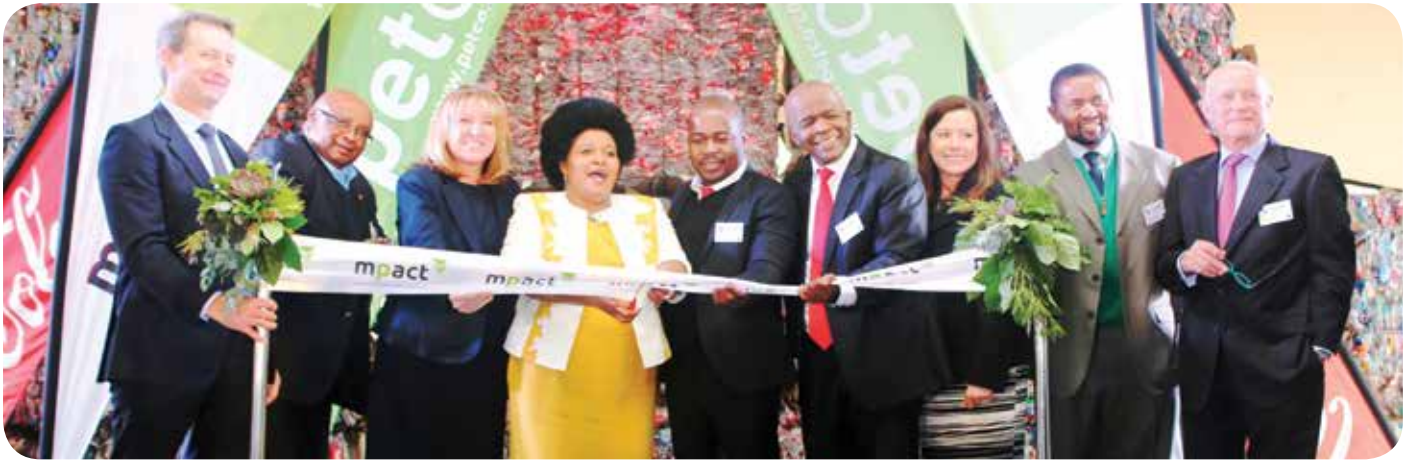
Above: Members of government and the private sector joined hands to open the Mpact Polymers plant in Germiston, Gauteng.

It was a joyous occasion as government and the private sector came together to open the Mpact Polymers plant in Germiston on 10 May 2016. The Mpact Polymers has provided direct employment for 85 people and it is estimated that an additional 1 000 jobs will be created through recycled polyethylene terephthalate (rPET) bottles.