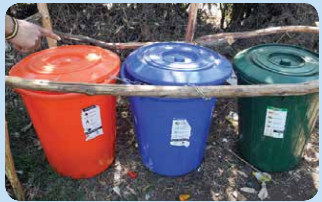
Above: Waste can be separated into different categories in order to make its collection efficient.

It is hoped that this model will also provide useful information to industry associations, who may have partial or full financial and operational responsibility for source separation