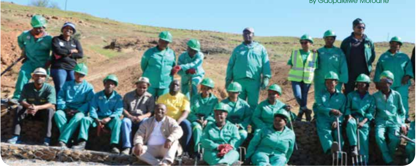
Above: EPWP beneficiaries alongside DEA staff who work at the site in Sterkspruit to combat the effects of drought and desertification.

The Eastern Cape Town of Sterkspruit was a hive of activity as an Inter-ministerial committee, led by Minister of Environmental Affairs, Mrs Edna Molewa did a site visit and public awareness initiative on Desertification, Land Degradation and Drought (DLDD) on Friday, 29 April 2016.