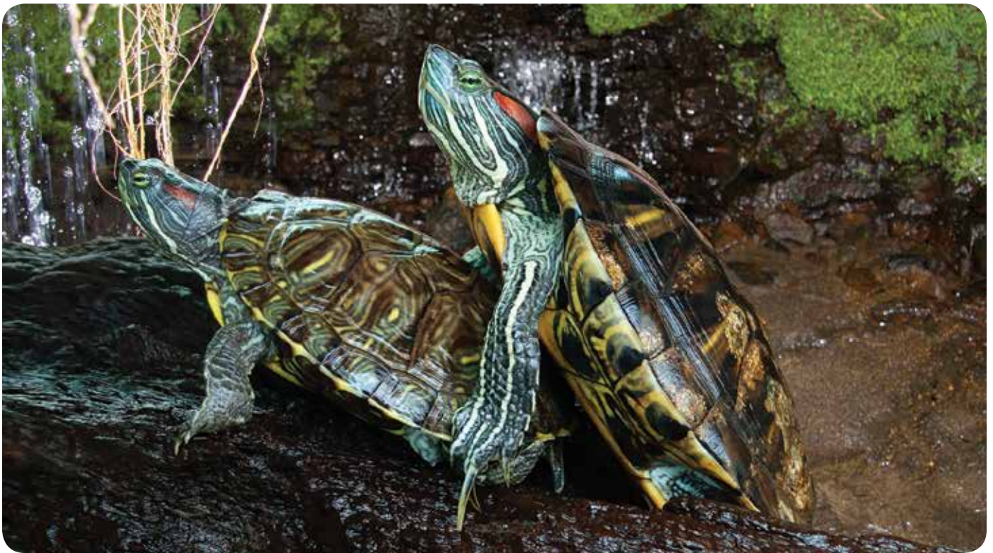
Above: The red-eared slider, also known as the red-eared terrapin, is a semiaquatic turtle belonging to the family Emydidae. It is a subspecies of the pond slider.

C ITES is the Convention on International Trade in Endangered Species of Wild Fauna and Flora. It is a multilateral treaty (an international agreement to which three or more sovereign states are parties) to protect endangered wild plants (flora) and animals (fauna). It was drafted as a result of a resolution adopted in 1963 at a meeting of members of the International Union for Conservation of Nature (IUCN). The text of the Convention was agreed at a meeting of representatives of 80 countries in Washington, D.C., the United States of America, on 3 March 1973, and on 1 July 1975 CITES entered in force.