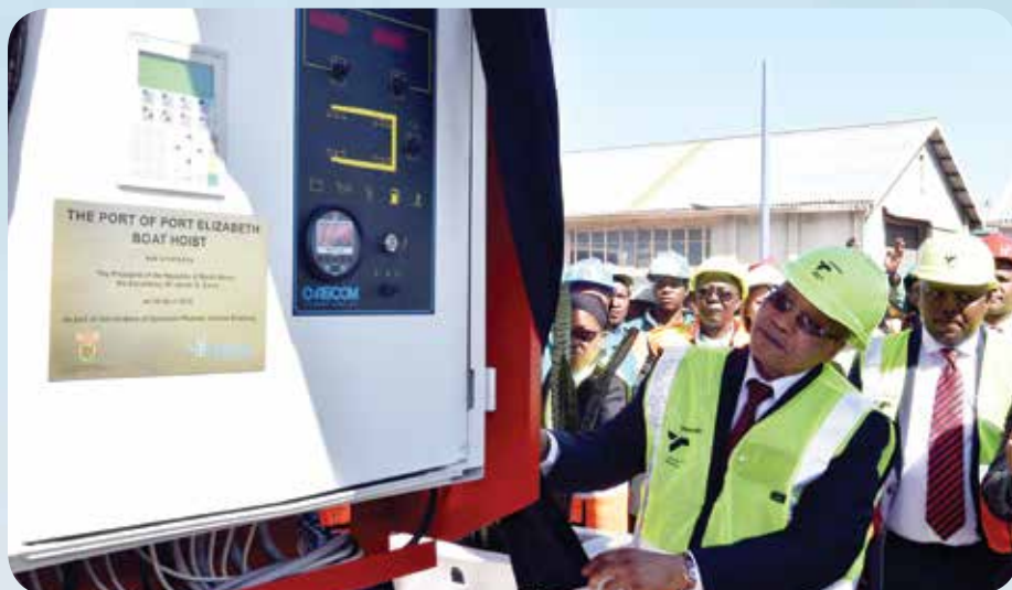
Above: The President unveils the plaque on the new boat hoist.

President Zuma visited the port of Port Elizabeth on 08 April 2016, to inspect the facilities first hand and to provide a progress report to the nation, on the implementation of South Africa's ground-breaking programme. Operation Phakisa which also covers the health and