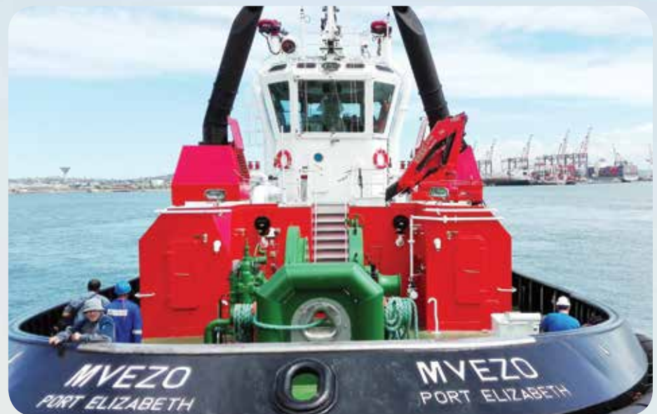
Above: The tugboat Mvezo is named after the birth place of late President Nelson Mandela.

An economic study was conducted of nine sectors that comprise South Africa's ocean economy and it was determined that the ocean has a potential to contribute up to R177 billion to the Gross Domestic Product and create up to one million jobs by 2033.