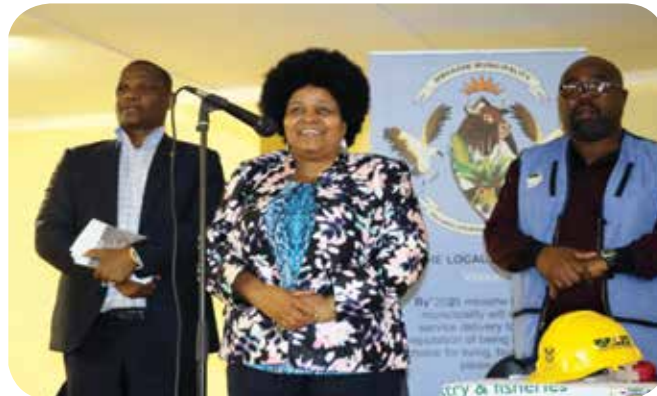
Above: MEC for Economic Development, Environmental Affairs and Tourism Mr Sakhumzi Somyo, Minister of Environmental Affairs Mrs Edna Molewa and Minister of Public Works Mr Thulas Nxesi address the audience during an inter-ministerial visit in Sterkspruit in the Eastern Cape.

The Ministers visited a pilot land rehabilitation project funded by the Department of Environmental