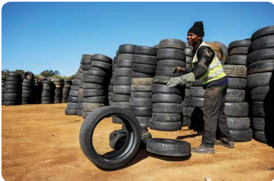
Above: The Recycling and Economic Development Initiative of South Africa (REDISA) Waste Tyre Management Plan defines a unique approach to waste stream management that is a world first, developed in South Africa and making the local tyre industry a national and world leader in recycling.

provided jobs and training to over 26 000 people per year from among the most marginalised sectors of society.