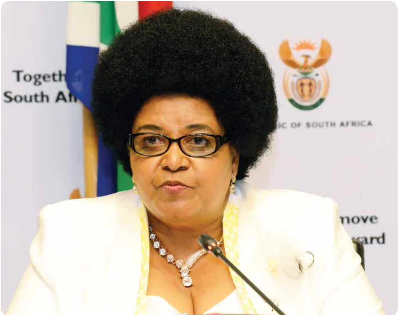
Above: On 03 May, Minister Edna Molewa delivered the 2016/2017 Budget Vote policy statement in Parliament in Cape Town.

As the world reflects on its efforts to protect the environment during Environment Month in June, the Department of Environmental Affairs (DEA), with Minister Edna Molewa at the helm, is leading the charge locally and has much to be proud of.