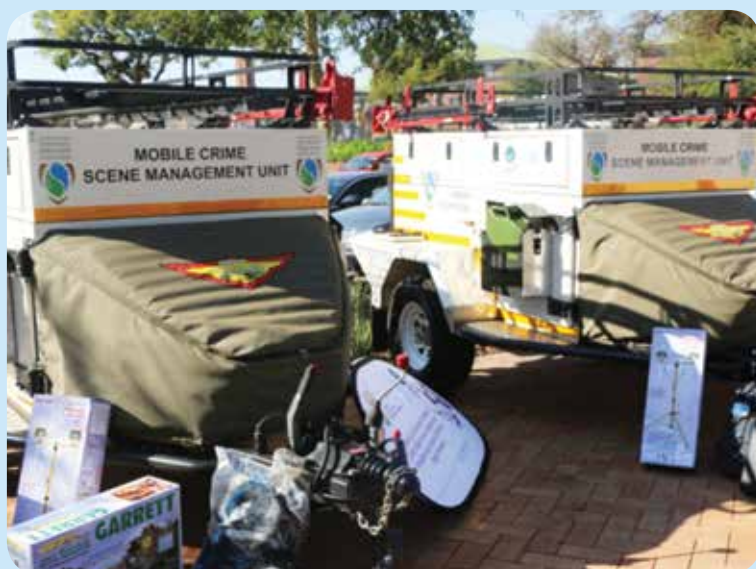
The trailers will assist when urgent forensic sample results are required for bail hearings involving suspected poachers.

“These successes are the result of the improved collaboration within the Security Cluster, as well as working with communities and non-governmental organisations. The Directorate for Priority Crime Investigation (Hawks) with their focus on dismantling complex organised crime enterprises remain committed to addressing the national and transnational wildlife trafficking threat through an integrated approach to prevent, combat and investigate wildlife trafficking,” said Minister Molewa. The Hawks presently have 6 projects