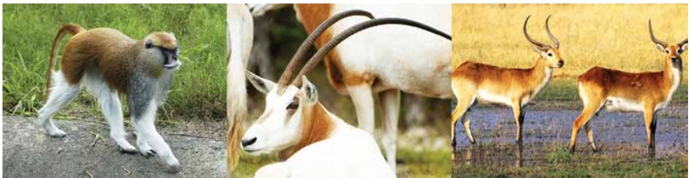
Above: Erythrocebus patas (Patas Monkey)