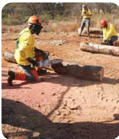
Above: The Extended Public Works Programme (EPWP), through Working for Water empowers people with skills through training, which in turn makes them more employable.

Further work opportunities will be created from the construction activities associated with the building or erection of landfill site offices, ablution facilities, as well as weigh pad platforms at landfill sites across the country.