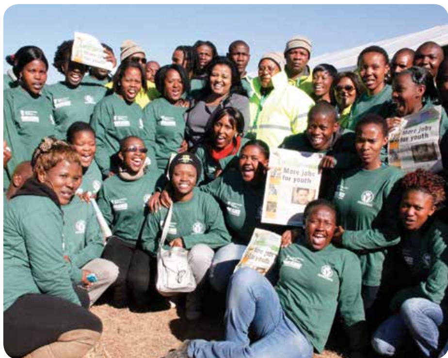
Above: Minister Edna Molewa launched the Youth Jobs in waste in the Free State in 2013.

The Working for Water programme employs and provides training to