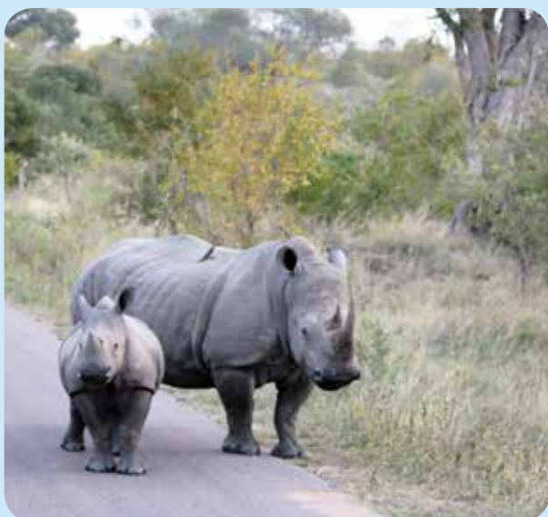
Protecting rhino from poachers has become part of the South African Government’s National Development plan, as well as its environmental assets.

Briefing the media on the management of rhino populations, the Minister said that the translocation programme, which is being used as a tool to enhance the safety and population management of rhino, continued in March 2016. Rhinos are being translocated to well-selected locations that meet strict suitability criteria. Lessons learnt from an evaluation of internal translocations in the Park, supported by the Peace