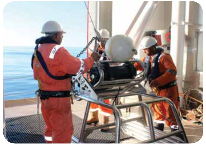
Above: Crew members of the SA Agulhas II prepare to launch the Ski-Monkey into the ocean.

Nothing quite prepares you for the beauty and incredible feeling when sailing aboard the Department of Environmental Affairs' SA Agulhas II. Although it's a working vessel, the comfort, food and fascinating research conducted aboard the ship, offers a truly unforgettable experience.