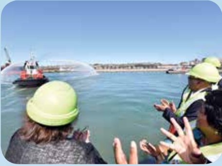
Above: The President and ministers observe the tugboat Mvezo going through its paces during the event.

communication ahead of the progress visit included radio and newspaper advertisements, loud hailing in the townships of Port Elizabeth, as well as social media. The event was so well received on the social media platforms, that it became the number one trending topic of the day.