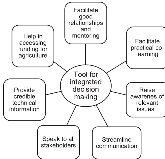
Figure 2: Expected capabilities of a tool for integrated agricultural land use decision making.

and provided insights into what users would find desirable in a tool for integrated agricultural land use decision making.