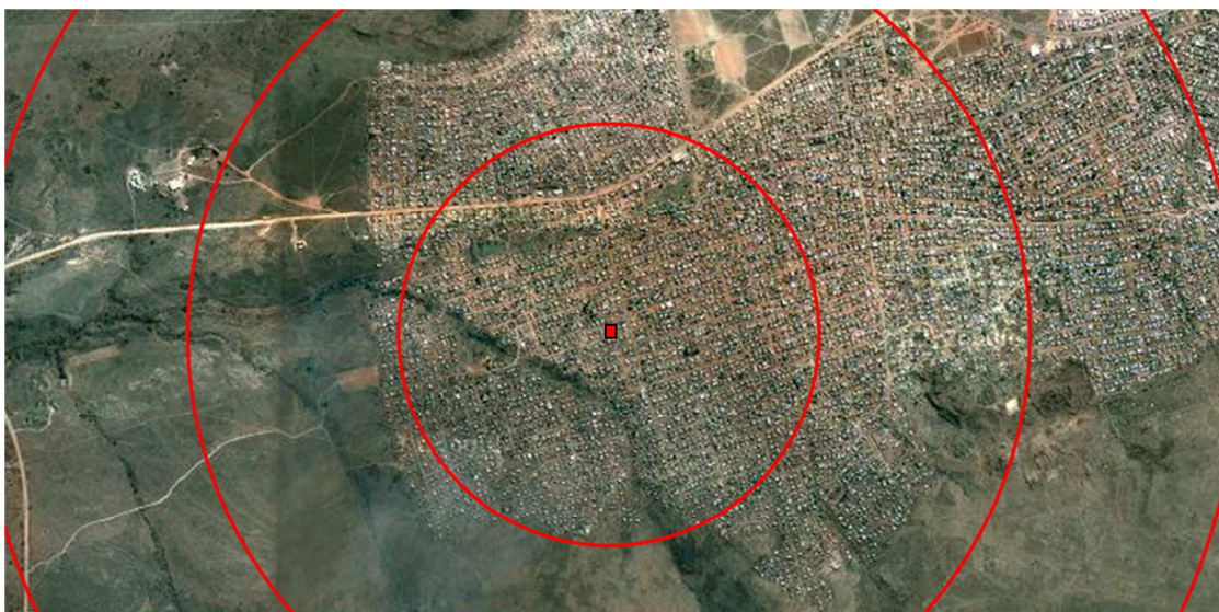
Figure 2. Study area. Red rings indicate 1, 2 and 3 km distance from household location (red dot)

The built environment sustainability criteria were applied to a household (red rectangle) in the centre of the study area. Rings of 1km, 2km and 3km were then marked on the study area plan, indicated in Figure 2. A survey of the household and area using the criteria was then carried out.