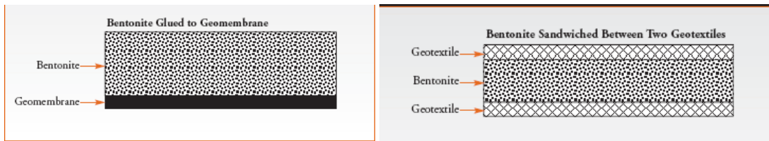
Figure 2: Typical Construction of GCLs

The use of GCLs is steadily increasing, because they offer significant benefits, such as cost-effectiveness, ease of manufacturing, laying and installation, superior performance and acceptance under regulatory system.