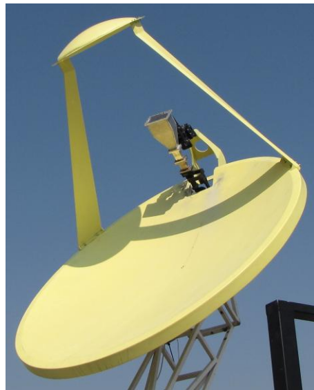
Figure 3: Reflector system of tracking radar antenna.