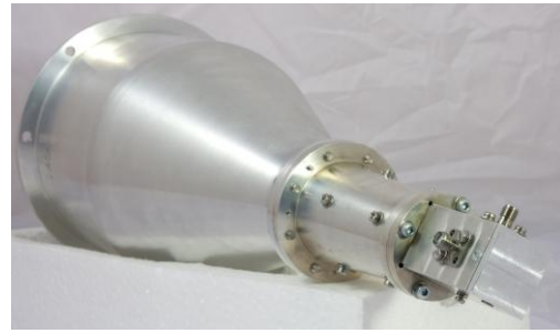
Figure 1: Low band dual polarized feed used for measurement radar.