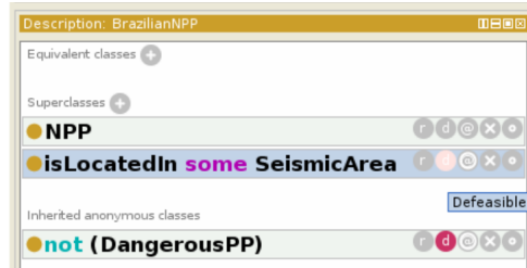
Fig. 3: RaMP: Toggling defeasibility of axioms

The reasoning algorithms implemented by RaMP work in a similar way. They compute a ranking (ordering) of the axioms in the ontology and use this ranking to determine which axioms are more important than others in the ontology. The details of these algorithms will be provided in Sections 3.1 and 3.2 respectively. An example ranking is depicted below in Figure 4. The axioms appearing on the light pink background are defeasible axioms while the others are hard.