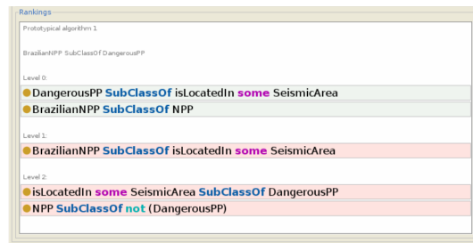
Fig. 4: RaMP: Axiom ranking display

The reasoning algorithms implemented by RaMP work in a similar way. They compute a ranking (ordering) of the axioms in the ontology and use this ranking to determine which axioms are more important than others in the ontology. The details of these algorithms will be provided in Sections 3.1 and 3.2 respectively. An example ranking is depicted below in Figure 4. The axioms appearing on the light pink background are defeasible axioms while the others are hard.