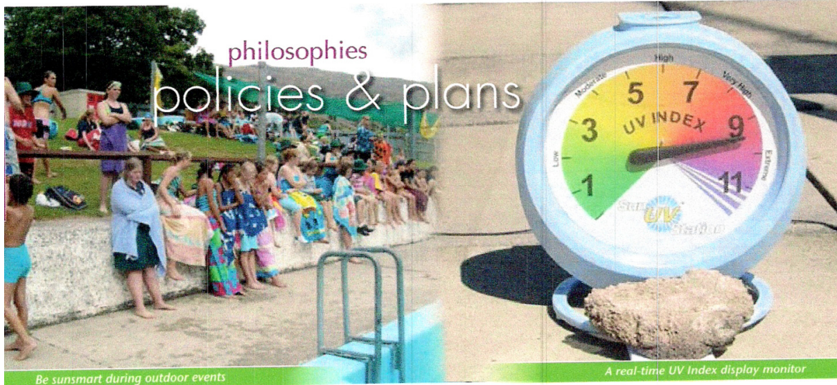
Be sunsmart during outdoor events