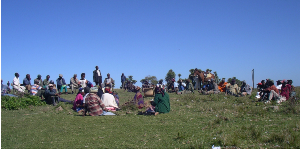
Figure 1: Headman of Lwandile oversees a village meeting.

methodologically (Crabtree et al., 2009). Our ‘real’ ethnography involves detailed analyses of what people do and how they organize action and interaction in their daily lives and, where possible, local views about actions. We do not think of such immersion as either ‘hanging out with’ locals or ‘talking to’ users; instead, we aim for a rigour in participant observation, dialogue and iterative processes of writing and reflexivity. That is not to say we have not used particular theoretical lenses, such as phenomenology, as rhetorical tools to emphasize elements in this context and motivate general design sensitivities (e.g. Bidwell, 2009). However, it is the fine details of what people did in the rural setting, depicted in our ethnography, that influenced our decisions in arranging and conducting a workshop and creating the technology probe.