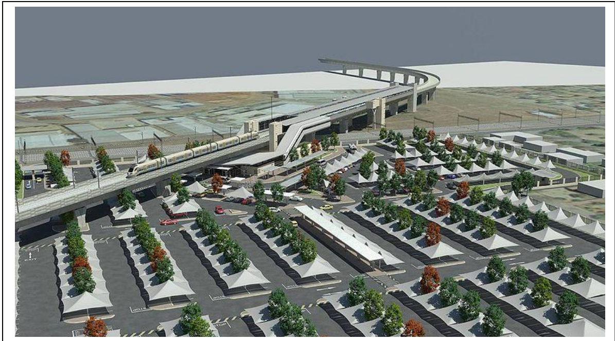
Figure 1: Gautrain Rhodesfield Station

The five key design principles for TOD are all notably absent, thereby negating the clear benefits to be derived from investment in a transit strategy such as the Gautrain.