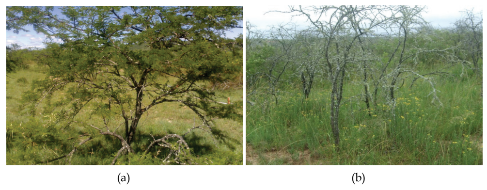
Fig. 2. (a). Stand of Acacia karoo (b). Dead stands of Acacia karoo form plots treated with Bromacil

Adelaide: I week before spraying Adelaide: I year before spraying