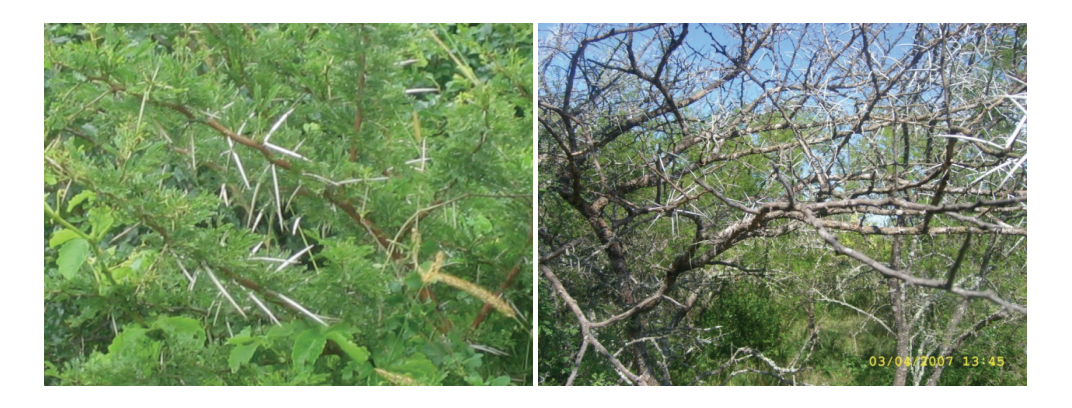
Fig. 3. Effect of bromacil application on Acacia Karoo over time

Adelaide: I week before spraying Adelaide: I year before spraying