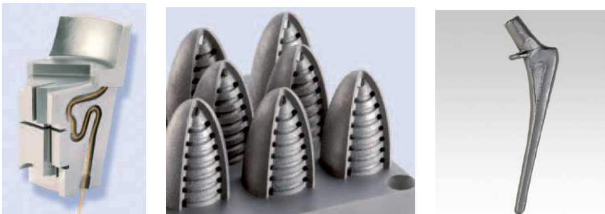
Fig-2 SLM steel insert with conformal cooling [9], SLM tool inserts with conformal spiral cooling [7], LENS Titanium hip stem [12]

LENS gives an added advantage of modifying/refurbishment of the surface of product if it is required in its life-cycle. Besides, the composition of the powder could be changed from one location to others during processing to make products of varied composition. This could also lead to the possibility of fabrication of Functional Graded Materials (FGM) [12-14].