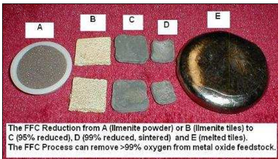
Figure 1. FFC Process: From mineral to metal

The FFC process can potentially offer near net shape parts, by pre-forming / moulding oxide powder to the intended shape product. A further advantage is that the solid product formed is a porous agglomeration of fine particles, capable of being crushed to produce titanium powder. In Figure 1 is shown pre-forms (B) produced from a metal oxide (A).