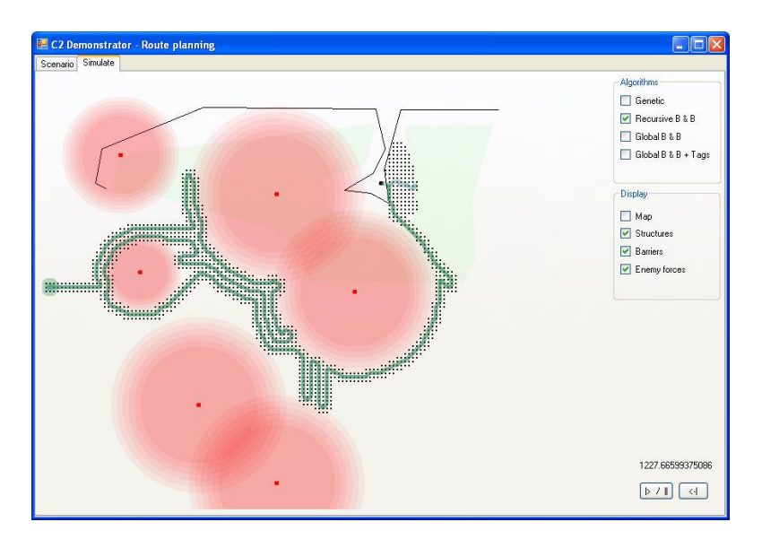
Figure 4: The Branch and Bound Algorithm

to the simulation at a time, duplicate the simulation environment for each solver or, the third option, keep all changeable variables in the thread-stack and within the proposed solution.