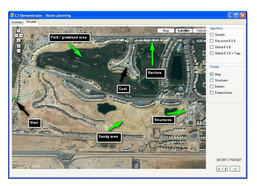
Figure 1: Modelling the Area of Operation

The important variables for structures are: