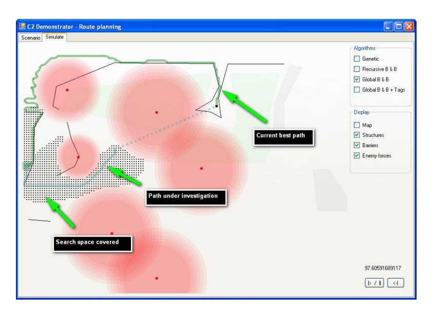
Figure 3: Modelling Active Elements

path. It may be that the agent abandons the vehicle at the starting position, implying that the vehicle is never used.