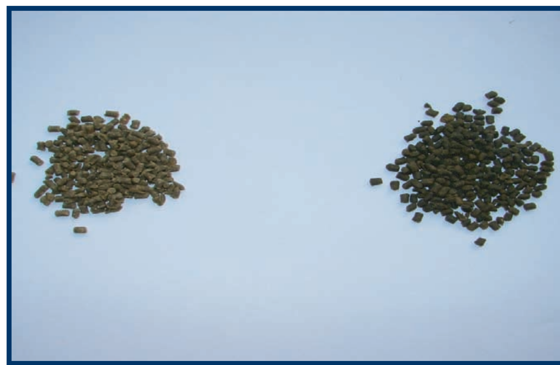
Figure 3: Examples of the feed pellets produced with brewers' spent grain for the juvenile fish feeding trial.

The HUFA-enriched cereal by-products (Fig 2) were incorporated into fish feed for white stumpnose (Fig 1) and dusky cob. Feeding trials with juvenile cob indicated that fish performance on this diet was comparable to that of control fish feed containing fish oil.