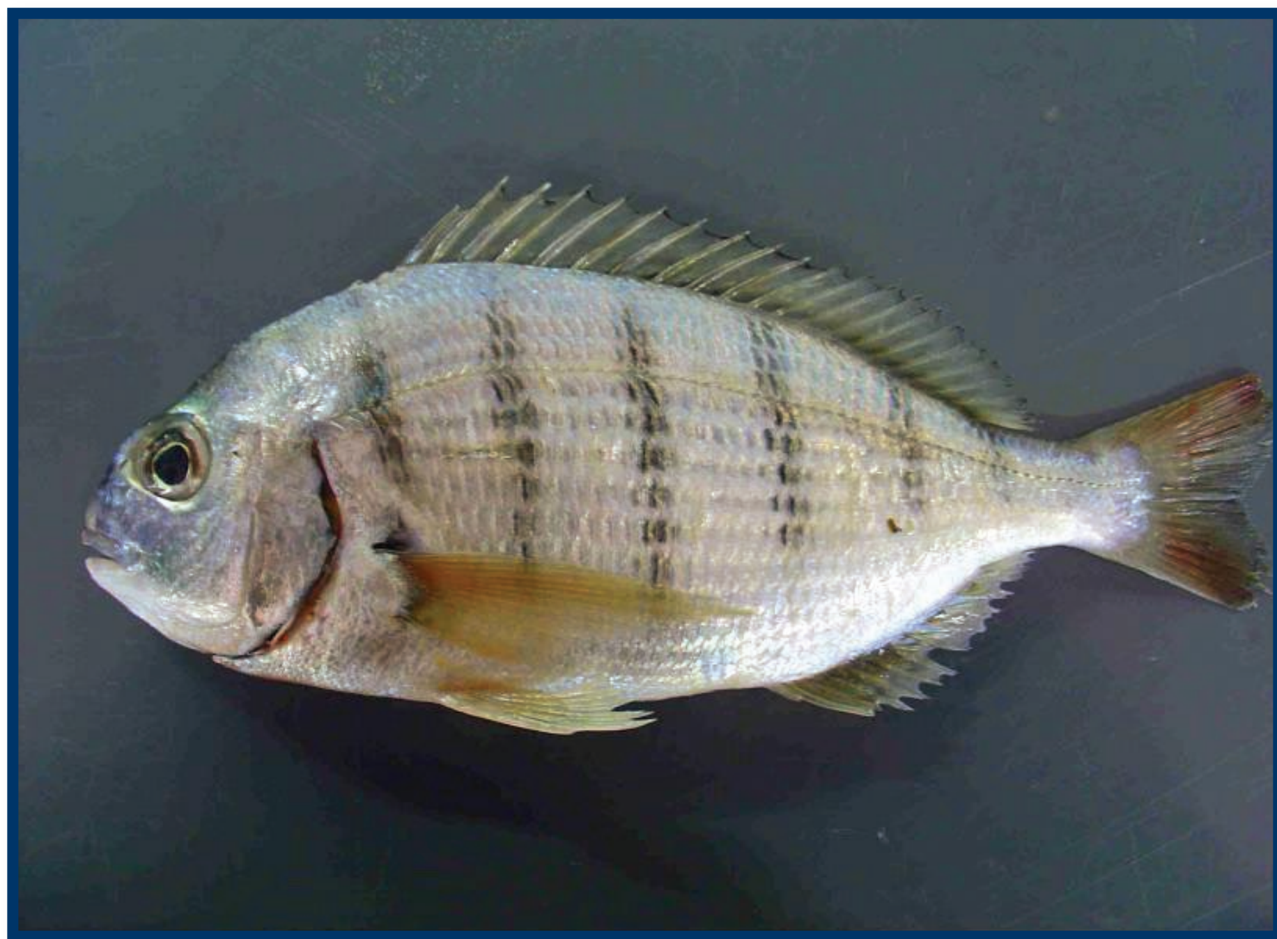
Figure 1: White stumpnose ( Rhabdosargus globiceps ) – one of the fish species fed on feeds containing processing by-products

A. JACOBS, J. REDDY CSIR Biosciences, PO Box 395, Pretoria, 0001 Email: ajacobs@csir.co.za – www.csir.co.za