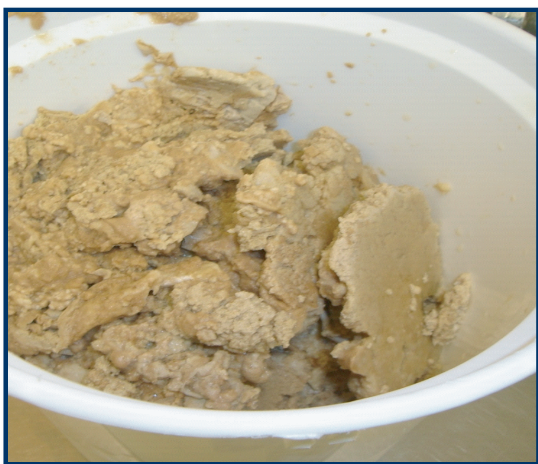
Figure 2: Mortierella fungal biomass containing fungal oils added to brewers' spent grain to produce fish feed

This research utilised agro-processing by-products (brewers' spent grain, soya oilcake and sunflower press cake) as fungal growth substrates for the production of HUFA.