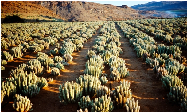
Figure 1. Hoodia cultivation site

Hoodia is a scarce succulent plant not easily cultivated. The CSIR's licensee has transferred technology for the controlled horticulture of the plant to South Africa, in line with the requirements for Good Farming Practice. Currently Hoodia is being cultivated as part of this programme on different sites in arid regions of the country. Local communities are involved in the cultivation programme.