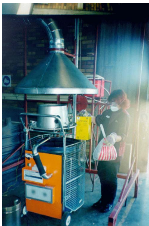
Fig. 1. The loading of the made up waste into the electrical unit.

where the clinic staff were to operate the incinerators. Laboratory tests on the emissions and waste destruction performances were carried out in an incineration test facility at the Council for Scientific and industrial Research (CSIR) in South Africa (see Figs. 1 and 2). The operating procedures supplied by the manufacturers of the test units were insufficient for the laboratory tests, e.g., the mass of waste to be loaded, and it was necessary to make additions to the procedures in order to achieve acceptable results in terms of the maximum capacity of each unit (Brent and Rogers, 1999b). Quantitative measurements were made on the emissions identified in the South African incineration guidelines (South African Department of Environmental Affairs and Tourism, 2004). On-line measurements were taken for combustion zone temperatures and combustion efficiency, i.e., carbon