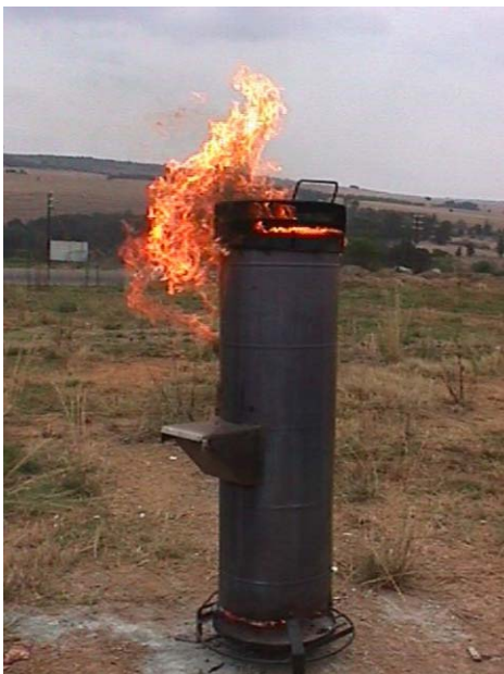
Fig. 4. The wood-fired unit at the clinic in Gauteng.

A set of performance specifications was prepared, based on the findings of the laboratory and field tests. None of the incinerators complied with the South African emission guidelines for conventional large-scale incinerators (South African Department of Environmental Affairs and Tourism, 2004). Recommendations were made for exemptions for small-scale units at remote rural primary healthcare clinics based on the composition and quantities of waste, and lack of other practicable options.