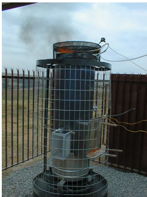
Fig. 5. Testing of the gas-fired unit at the clinic in Gauteng.