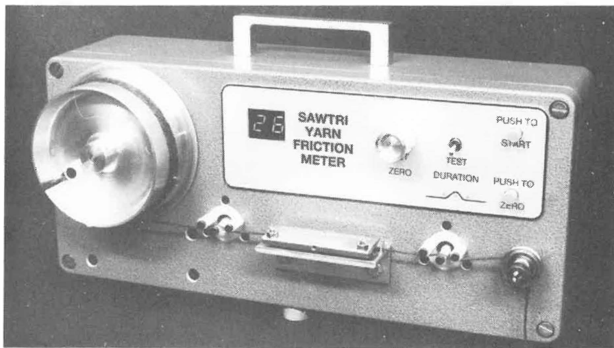
SAWTRI's Yarn Friction Meter