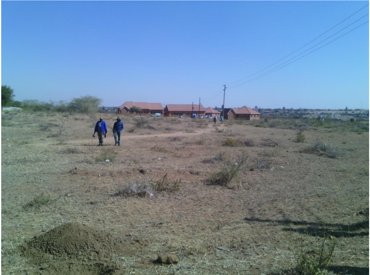
Exhibit 1: A Photo of the SEIDET Campus