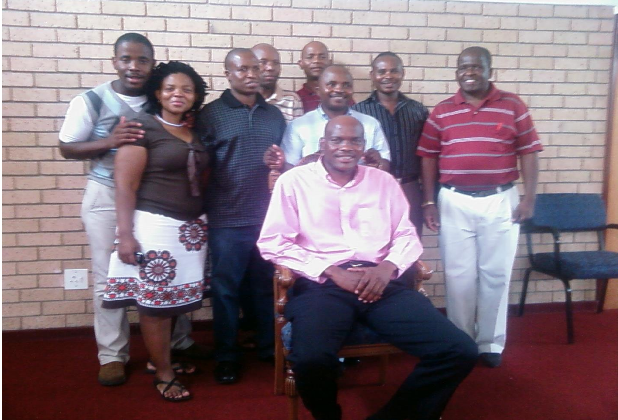
Exhibit 5: King Makhosonke of the Ndebele People and the SEIDET Board