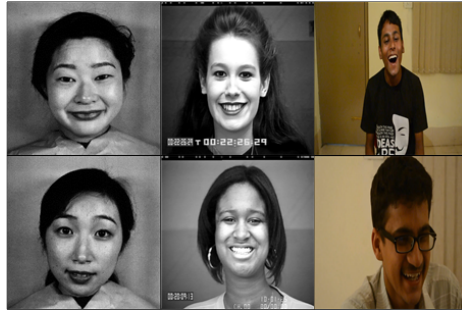
Fig. 1: The happy expression among six different subjects. The images are from the following databases: JAFFE [10], CK+ [9], ISED [3]

measuring relative positions between eyes, nose, mouth and ears then combining it into a single feature vector describing the face. Appearance based methods differ in that they focus on the individual pixel values rather than relative distance or shape of feature components [14]. They use image filters to get features based on a holistic approach, that is, using the whole face or a region of interest (ROI) of the face to create local features [11]. To strengthen robustness against factors such as occlusion, illumination and pose variations in facial expression recognition many techniques have been researched, such as Principal Component Analysis (PCA), Linear Discriminant Analysis(LDA), Independent Component Analysis(ICA) [1]. These methods have been used holistically or locally to extract facial appearance changes [5]. To overcome the shortcomings of LBP newer methods such as Local Ternary Pattern(LTP) [6] and Local Directional Pattern(LDP) were introduced.