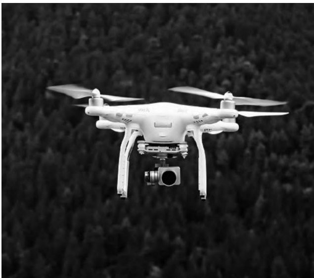
Using drones in forest monitoring has become increasingly popular around the world

In addition, this chapter has highlighted that there are a number of ways in which reciprocal relationships across forest-water landscapes are managed in multi-stakeholder decision settings. While there is a growing emphasis within some policy, academic and donor literature on the importance of mediating these relationships