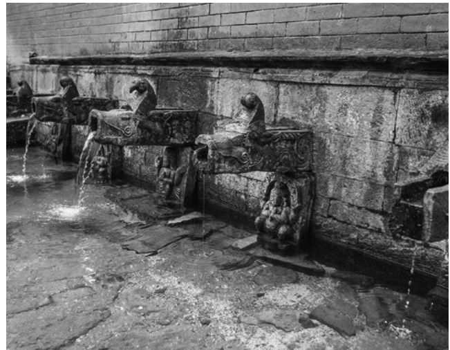
Godavari Kunda, a sacred spring located on the outskirts of Kathmandu, Nepal. Thousands of pilgrims come to the spring every 12 years (next time in 2027) to bathe and gain spiritual merit

Previous work mapped South Africa's surface-water source areas and showed that just 8% of the country's land surface area contributed 50% of its runoff (Nel et al., 2011, 2013). The term 'water source area' should ideally include both surface-water and groundwater source areas, and it should include an indication of the strategic significance