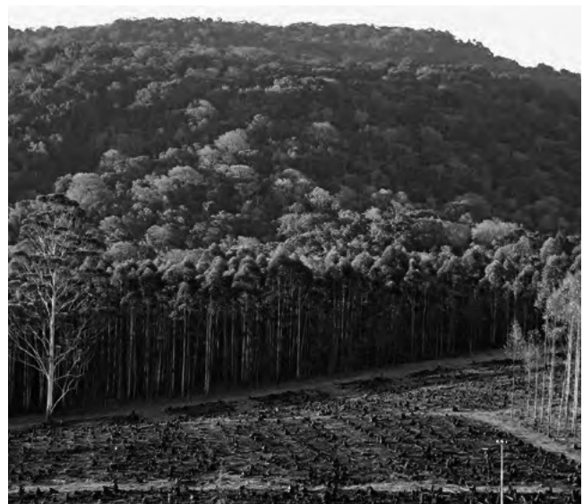
Eucalyptus plantation and indigenous forest in South Africa

always planted in rows to optimise tree growth and harvesting, and therefore increase LAI, and as a result decrease forest water yield (Brown et al., 2005). Additionally, the majority of plantations are rapidly growing monocultures of exotic species with less biodiversity compared to natural stands (Brockerhoff et al., 2008). This type of forestry can increase water demands by the trees (Scott et al., 2004) as well as increase the risk of episodic insect and disease outbreaks, or fire that can threaten the health of the entire stand (Mitchell et al., 1983; McNulty et al., 2014). While complete stand or catchment mortality can significantly increase streamflows, tree mortality may also decrease water quality (Hibbert, 1965; Swank et al., 2001).