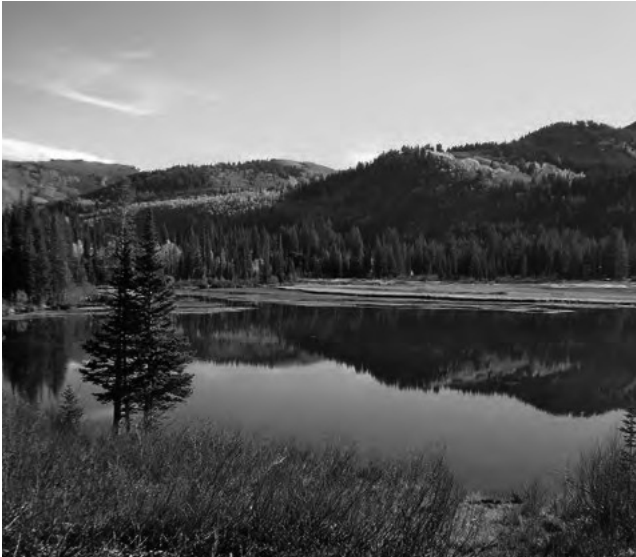
Silver Lake in Uinta-Wasatch-Cache National Forest, Utah (US) and the surrounding Wasatch watershed provide multiple benefits to stakeholders and users