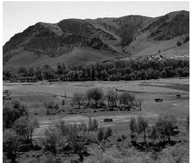
Riparian vegetation and landscape in Mongolia

The timing of water flow is important to proper aquatic zone structure and function. Increases in annual water flow