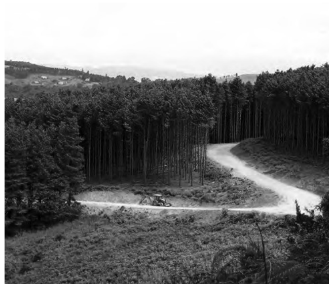
Pine plantation in South Africa

Plantation forests are becoming increasingly common and represent approximately 7% of the world's total forest area (Payn et al., 2015; FAO, 2015). Highly managed conditions, which include stand fertilisation, thinning, regular tree spacing, genetically improved growing stock, controlled burning and other practices, are designed to increase the growth rate and wood quality (Fox et al., 2004). Management practices increase growth by maximizing leaf area and growth efficiency (Waring, 1982). Increased leaf area can increase water demand by trees (Scott et al., 2004).