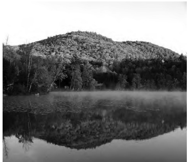
Mirror Lake near Hubbard Brook Experimental Forest (West Thornton, New Hampshire, US)

Forest vegetation succession provides strong negative feedbacks that make permafrost resilient to even large increases in air temperatures. However, as seen in boreal forests of Alaska, climate warming is associated with reduced growth of dominant tree species, plant disease and insect outbreaks, warming and thawing of permafrost, drying of lakes, increased wildfire extent, and increased post-fire recruitment of deciduous trees. These changes have reduced the effects of upland permafrost on regional hydrology (Chapin et al., 2010). Surface water, in contrast, provides positive feedbacks that make permafrost vulnerable to thawing even under cold temperatures (Jorgenson et al., 2010). In watersheds with low permafrost, base flow is higher, and annual water yield varies with summer temperature, whereas in watersheds with high permafrost, annual water yield varies with precipitation (Jones and Rinehart, 2010). With climate warming and loss of permafrost, stream flows will become less responsive to precipitation and headwater streams may become ephemeral (Jones and Rinehart, 2010).