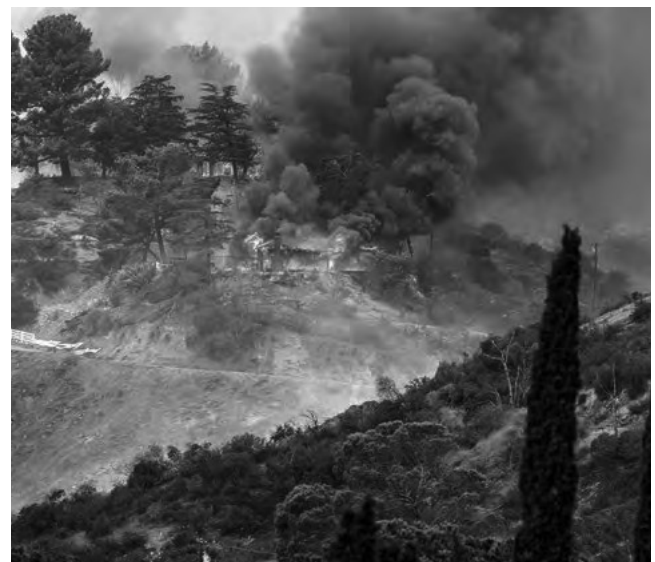
La Tuna wildfire in Los Angeles, CA in 2017

In the immediate aftermath of wildfires, the burnt soil is bare and dark, and highly susceptible to erosion,