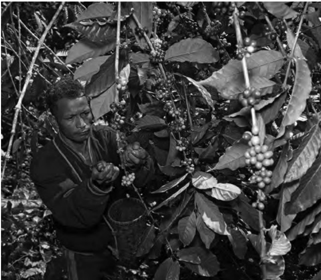
Coffee is a commodity of the Wae Rebo people in East Nusa Tenggara, Indonesia. Their coffee plants are directly adjacent to natural forests